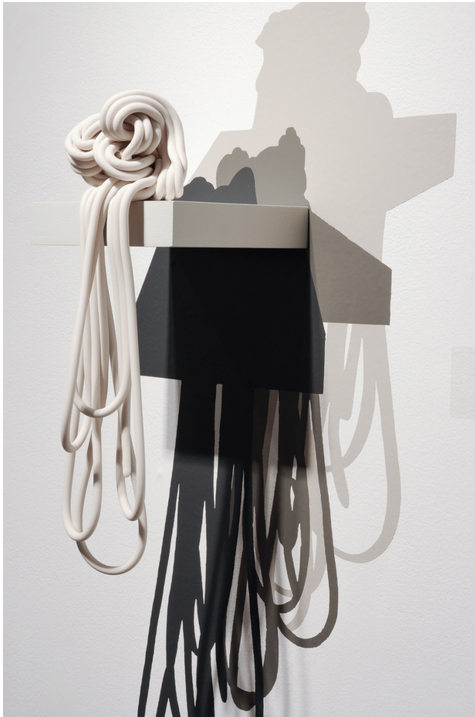
5) Untitled (LSF #4 detail) porcelain and digitally cut wall vinyl fired to cone 6 in oxidation 30in h X 16 in w X 11in d 2019