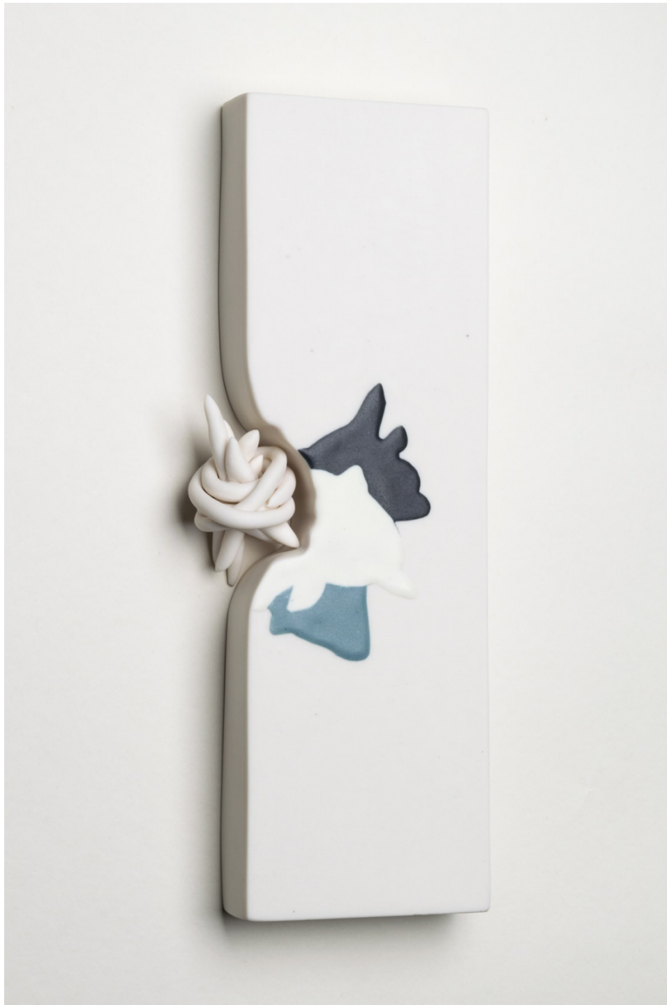
17) From the Penumbra Series 076 porcelain fired to cone 6 in oxidation 9in h X 4in w X 1in d 2019