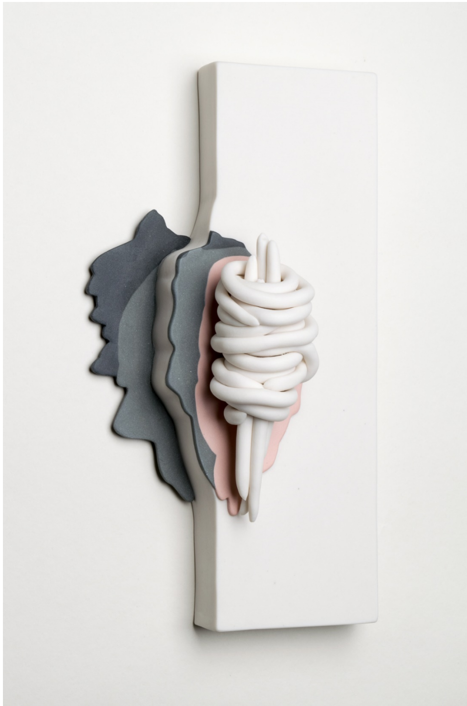
16) From the Penumbra Series 075 porcelain fired to cone 6 in oxidation 9in h X 6in w X 2in d 2019